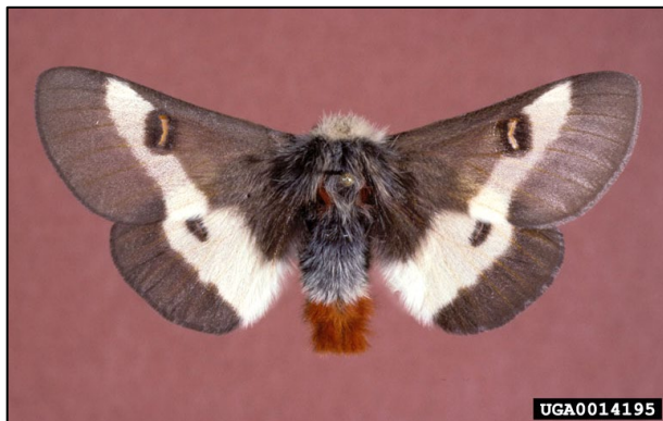
Figure 1. Buck moth.

Adult buck moths have a wingspan of 2-3 inches (5-7.5 cm). The black, semi-transparent wings have a white band and prominent eye markings on the forewings (Fig. 1). The body is stout and hairy, with a grayish-black abdomen and a reddish orange or dark coloration at the tip.