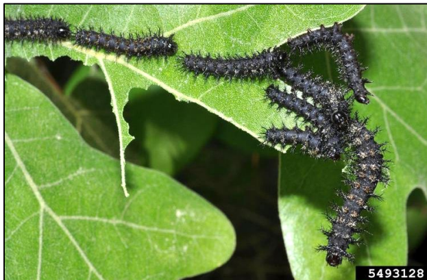
Figure 3. A cluster of buck moth caterpillars.

caterpillars tend to live singly. Mature larvae sometimes wander from their host plants before pupating. Adult buck moths emerge in the fall to mate and lay eggs.