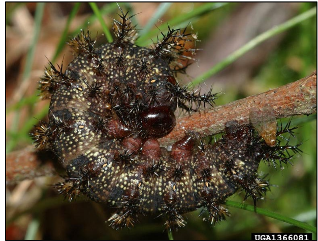
Figure 2. Buck moth caterpillar.

spines are black and white. Young caterpillars may be generally darker in color than mature caterpillars.