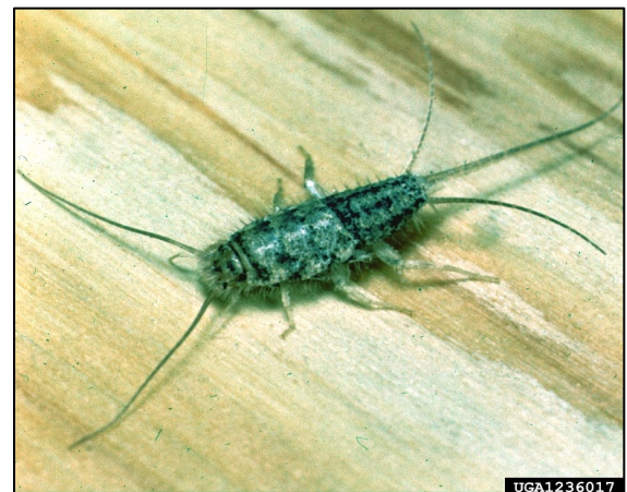
Figure 3. Firebrat.