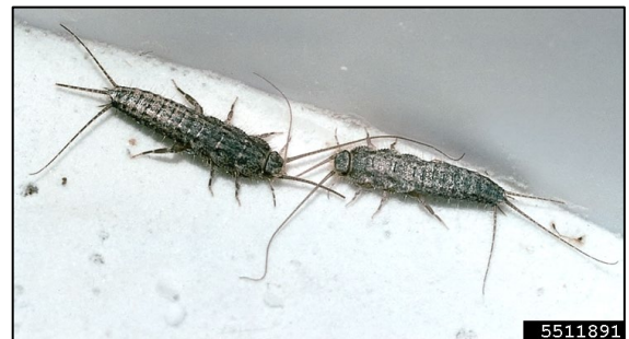
Figure 2. Fourlined silverfish (Kansas Department of Agriculture, Bugwood.org).

survive, but firebrats prefer higher temperatures of 86°F or higher (>30°C). In buildings, firebrats are often found near boilers, furnaces, hot pipes, and other heated areas while silverfish are commonly seen in attics, basements, garages, bathrooms, and other areas with lower temperatures. Both silverfish and firebrats are nocturnal insects that avoid light and run swiftly. Homeowners may not be aware of the presence of these pests until one is found trapped in the bathtub or sink. Outdoors these insects live under rocks and bark; in leaf litter; in caves; or in the nests of birds, mammals, and sometimes the colonies of other insects.